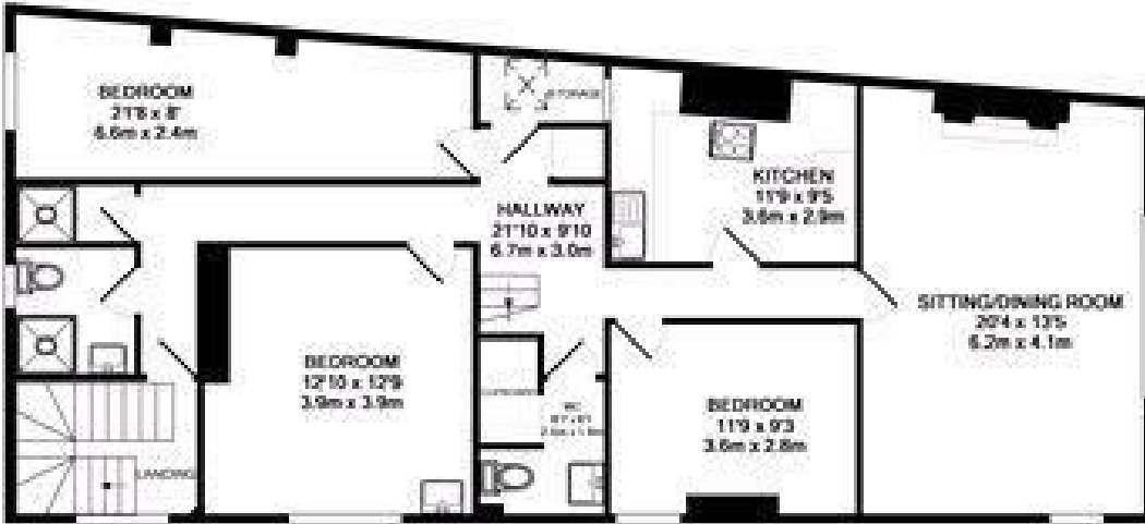
1ST FLOOR APPROX. FLOOR AREA 102.6 SQ.M. (1105 SQ. FT.)