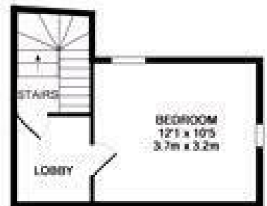
3RD FLOOR APPROX. FLOOR AREA 19.6 SQ.M. (213 SQ. FT.)